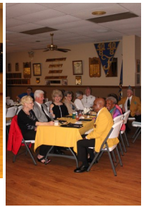
Visiting Goose Creek SC for the 33rd Annual Gator Wreck