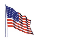
Memorial Day Weekend Activities in Lorton VA and Arlington National Cemetery